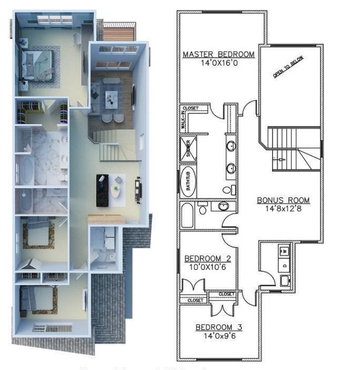
Upper Floor - 1147 sq.ft.

DATA IS DEEMED RELIABLE BUT IS NOT GUARANTEED ACCURATE BY THE REALTORS® ASSOCIATION OF EDMONTON. COPYRIGHT 2025 BY THE REALTORS® ASSOCIATION OF EDMONTON. ALL RIGHTS RESERVED. Trademarks are owned or controlled by the Canadian Real Estate Association (CREA) and identify real estate professionals who are members of CREA (REALTOR®, REALTORS®) and/or the quality of services they provide (MLS®, Multiple Listing Service®)